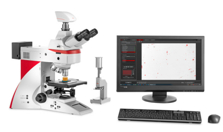
DM4 M Upright Microscope - Advanced Configuration

All configurations of the Steel Quality solution suite are available with upright as well as inverted microscopes.